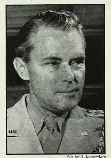
GENERAL VANDENBERG The long and the short of it.

This week, the new council voted 4 to I to renew the movie license for a year. It looked as if the great god Progress might yet bring to Sioux Center's Main Street the last detail it needed to make it the duplicate of Main Streets up & down the land: a neon-trimmed marquee and posters showing Betty Grable's legs.